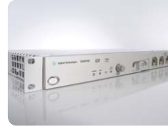
Ideal for ATE rackmount applications