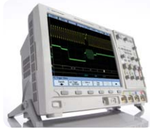
Largest display, shallow depth

Agilent's InfiniiVision lineup includes 5000, 6000 and 7000 Series oscilloscopes. These share a number of advanced hardware and software technology blocks. Use the following selection guide to determine which best matches your specific needs.