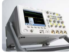
Optional battery, 100 MHz MSO