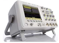
Smallest form factor, lowest price